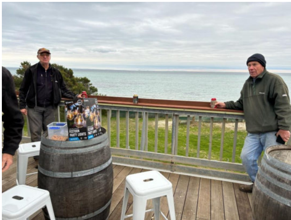
A new addition to the upstairs, a place to put your nice cool drinks.