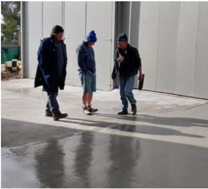
Finished at last!!!