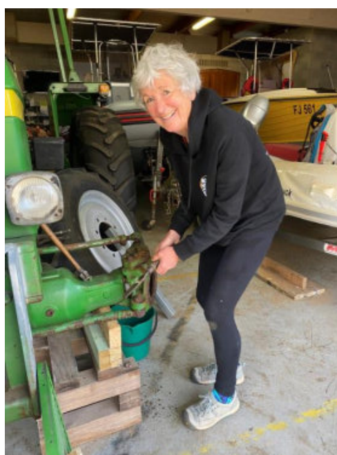
Val helping to take Arnie apart.