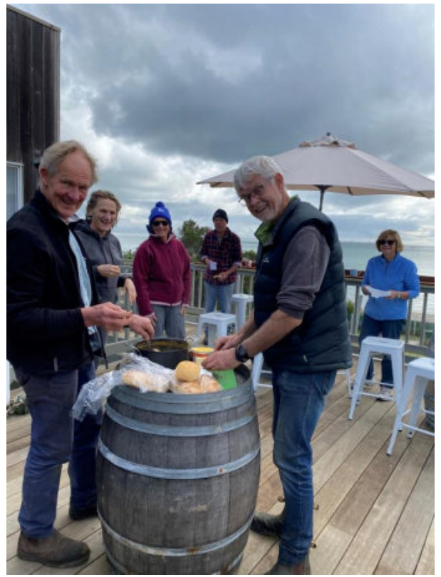
Volunteers having a nice lunch of fish and chips.